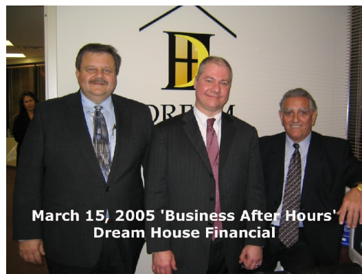
March 15, 2005 'Business After Hours' Dream House Financial

May 5, 2005, 5:30 p.m. 40th Annual Silver Gull Awards Dinner Ocean Place Resort & Spa, Long Branch