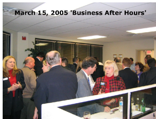
March 15, 2005 'Business After Hours'